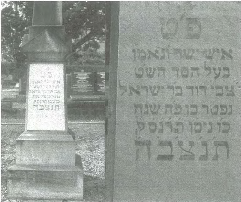
Hebrew Inscription — Herman Dinte Jewish Section Toowong Cemetery Brisbane