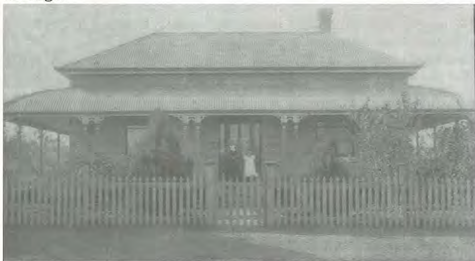
Family Home c1880 — Warwick