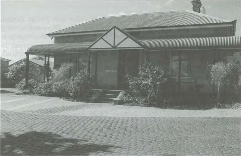
Current home as part of Motel, Victoria St Warwick, Queensland