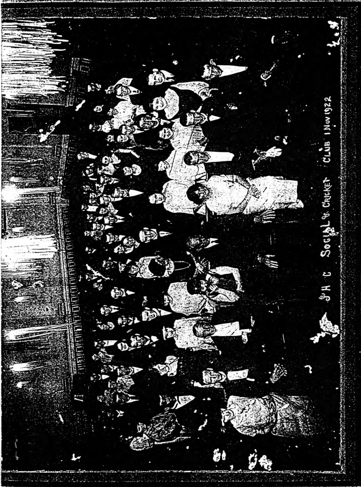
J. H. C. SOCIAL & CRICKET CLUB 1 Nov 1922